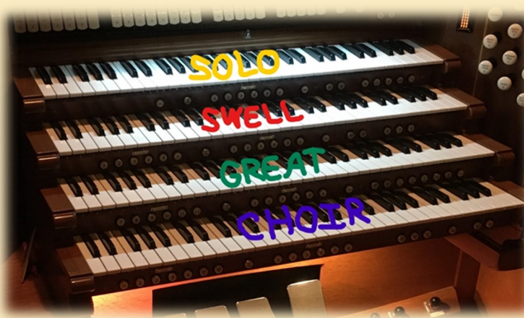
Organ console at Trinity United Presbyterian Church

Additional manuals in larger organs beyond the basic three can take on a number of names de-