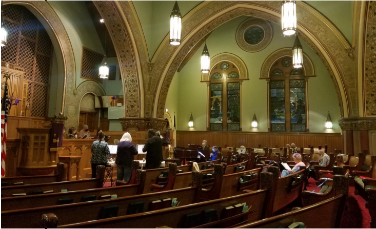
The Lenten Holden Service at Trinity